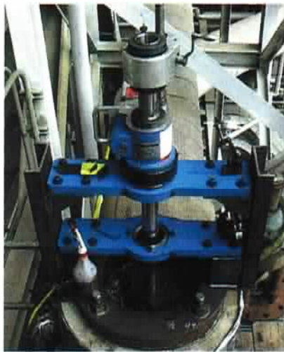
The Climax BB5000 Boring Machine is precise and powerful enough to easily remove 100,000-psi tensile strength material so the isolation valve could be re-machined to factory specifications.

Hughes rented the BB5000 Boring Machine manufactured by Climax Portable Machine Tools, Inc. ( www.cpmpt.com ). The BB5000 120-V motor option J-S Machining selected provides